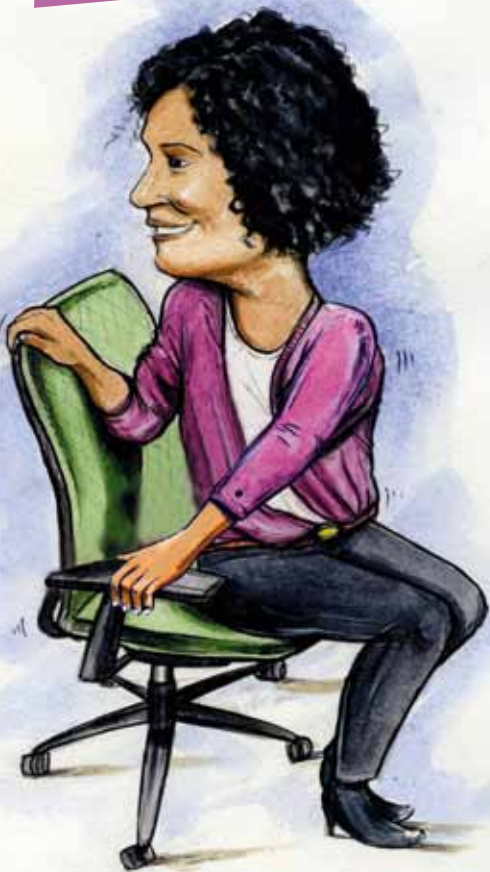
ILLUSTRATION: MARC GOODERHAM